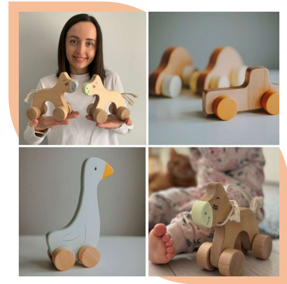
Olga Puškina founded the company "Simple Toys", which manufactures wooden toys